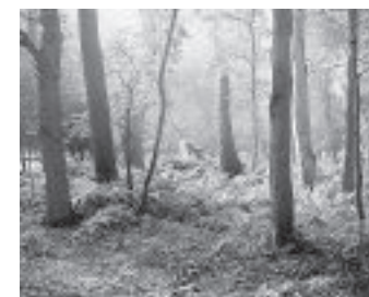
An image from the Fugue State project