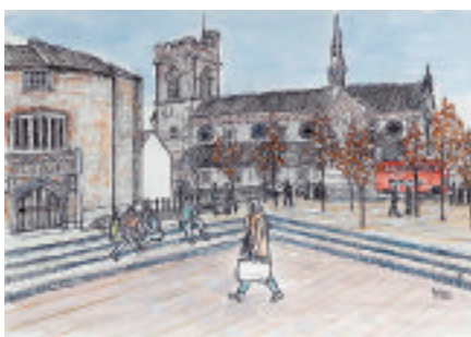
St John The Baptist Church in High Barnet

Many of Renos' drawings are created using pen and Indian ink with a touch of pencil work and a watercolour wash. A picture can take him up to 30 hours to complete, depending on the level of detail.